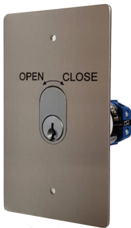
Stainless Steel Wall Mount

LIW Order Code “OVAL3/KEJB1” 100mm X 100mm X 100mm