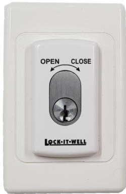
Clipsal 2000 Series Wall

With this range of 4 Key Switches you can simply choose the correct switch for your needs. Available with 5 different fixing: Slim Line Surface, Clipsal 2000 series, Surface fix Mount box, Stainless steel flush fit or Water resistant Surface mount. All switches are easy for the client to adapt to a master key system and use standard key cylinders.