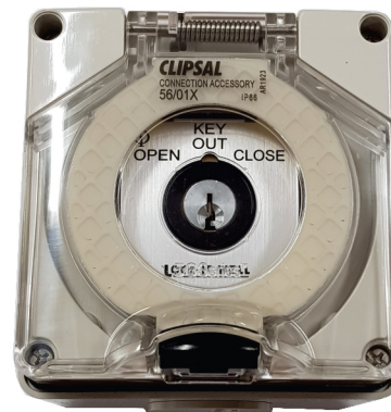
Water Resistant Box IP66 Weather Rated

LIW Order Code “OL415007/PZ25” 70mm X 115mm x 64mm (Cavity Depth)