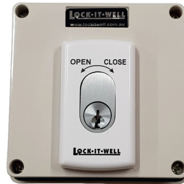
Surface Box Non-Weather Rated

LIW Order Code “OVAL3” 75mm X 115mm x 45 (Cavity Depth)