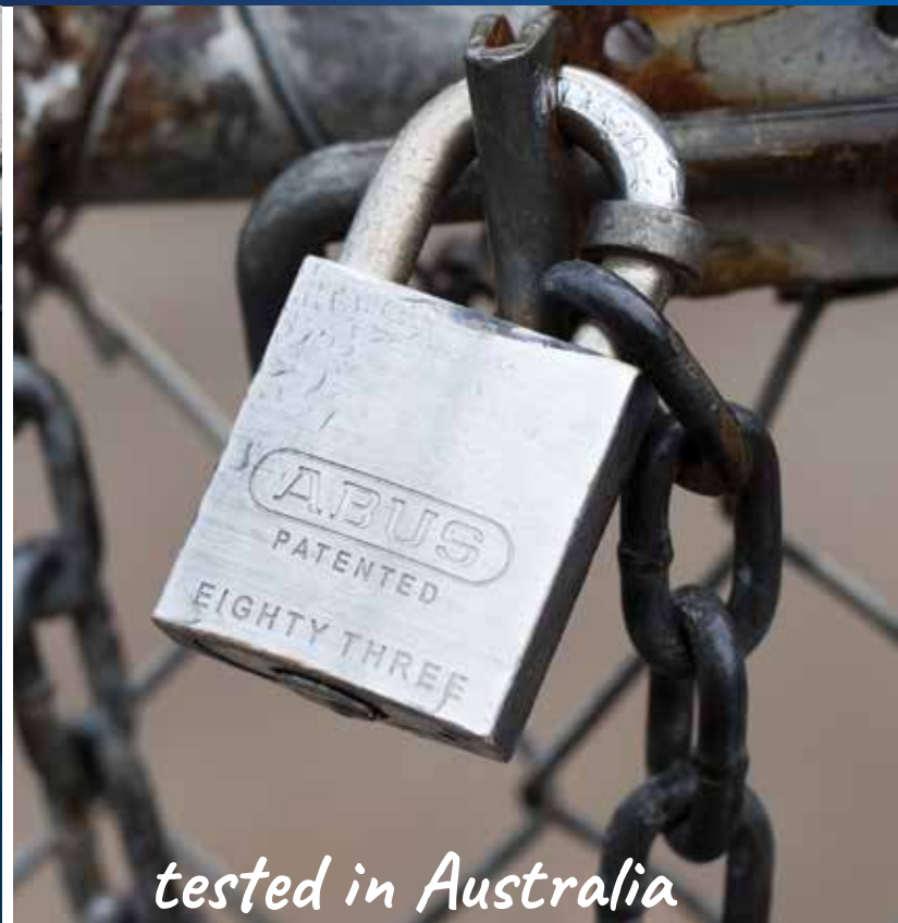
tested in Australia